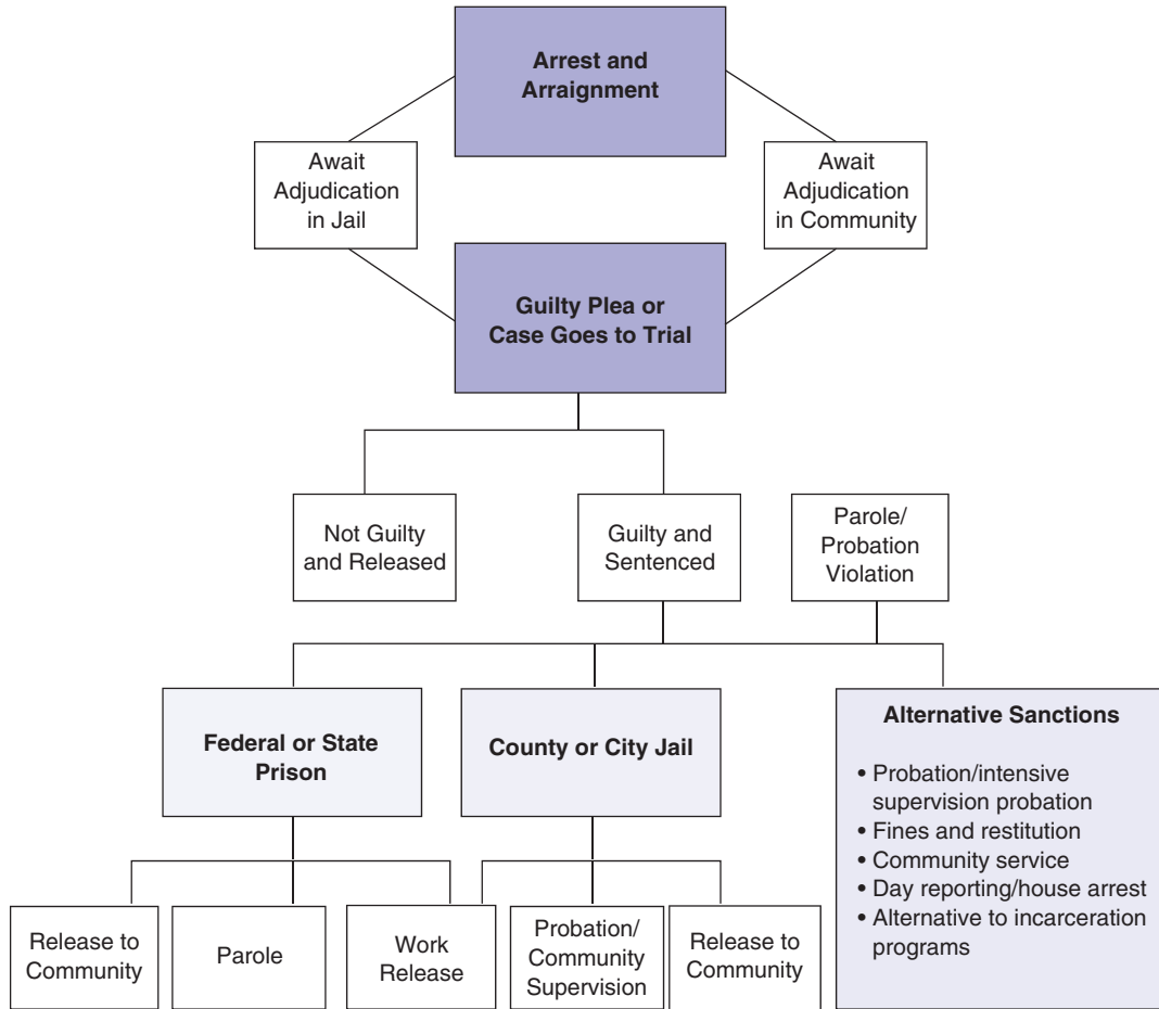
FIGURE 1.2 Criminal Justice System Flowchart